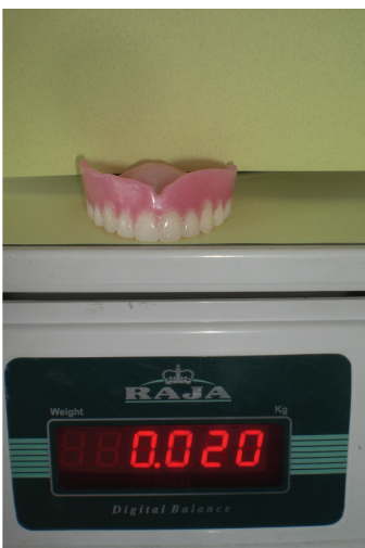
[Table/Fig-5]: Weight of denture after putty removal