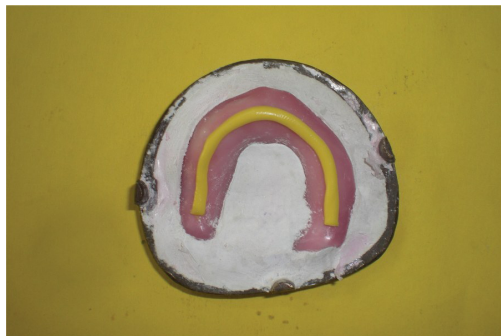
[Table/Fig-3]: Placement of putty