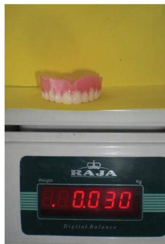
[Table/Fig-6]: Weight of denture made with conventional manner

is available between denture base and teeth [Table/Fig-2]. After confirming the space, rope shaped poly vinyl-siloxane putty was secured on maxillary permanent denture base with cyanoacrylate adhesive [Table/Fig-3]. In conventional way flasking and curing of denture were done for both hollow and conventional dentures. Once the dentures were fabricated, small holes were drilled in posterior and slightly palatal region of the denture, putty was removed and holes were closed with self cure PMMA resin [Table/Fig-4]. Another conventional maxillary denture was fabricated in conventional manner for the same patient by same doctor and technician to eliminate the denture processing errors.