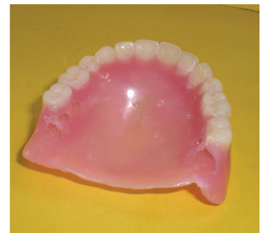
[Table/Fig-4]: Space created for removal of putty